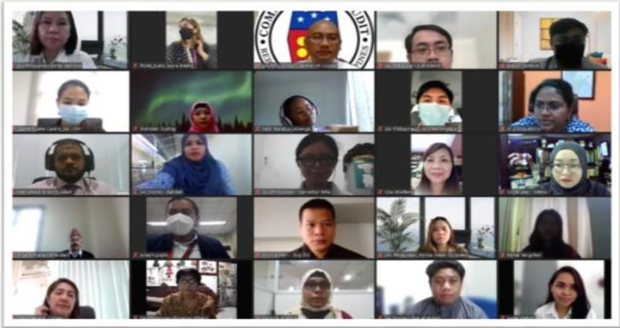
114 participants from 23 SAI in First Batch of 9 th ITP from 22 nd to 26 th Nov, 2021